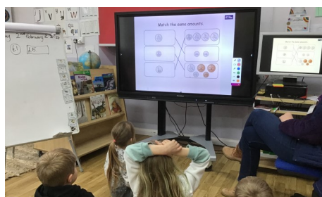
Year 2 Maths. Getting to grips with money!